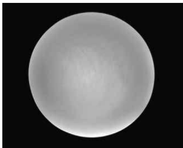
Susceptibility Weighted Image acquired at 3T